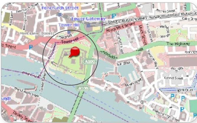
Map data: OpenStreetMap | ODbL 1.0 , Tiles CC-BY-SA 2.0

A geofence is a "virtual electronic protective fence" around an area, that needs to be monitored (e.g. your branch or a building site). You automatically receive an e-mail or text message, if deviations from the plan occur. For example, you will be notified if a machine does not reach the zone, at the expected time or, if leaves it unexpectedly. This way you are always up-to-date and can take the appropriate course of action. In the event, that your equipment or vehicles are stolen, our technology will find it using GPS tracking.